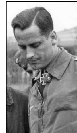
Above: Gerhard Schöpfel

Below: Oblt Gerhard Schöpfel's 'Yellow 1' hidden amongst the trees in France. He used this Me109 to shoot down four Hurricanes of 501 Squadron in just a few minutes over Canterbury.