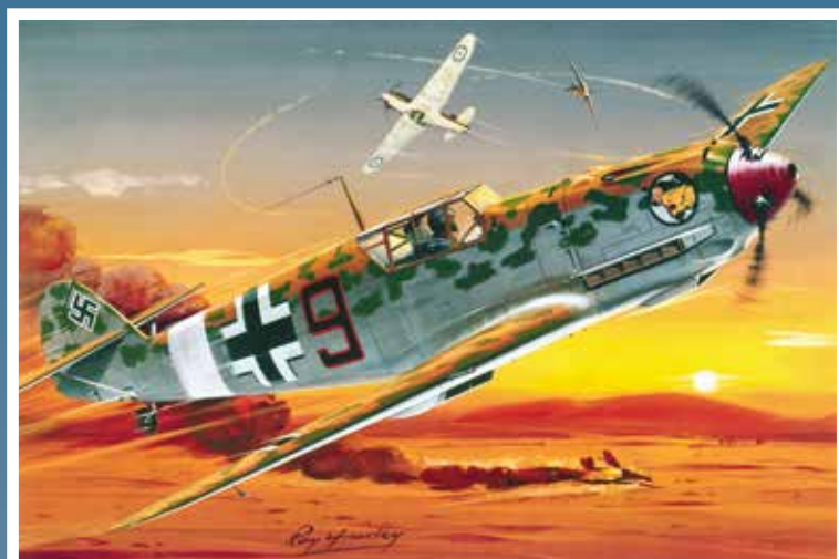
PK-017 MESSERSCHMITT Bf109E