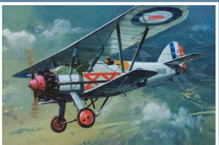
PK-025 ARMSTRONG WHITWORTH SISKIN