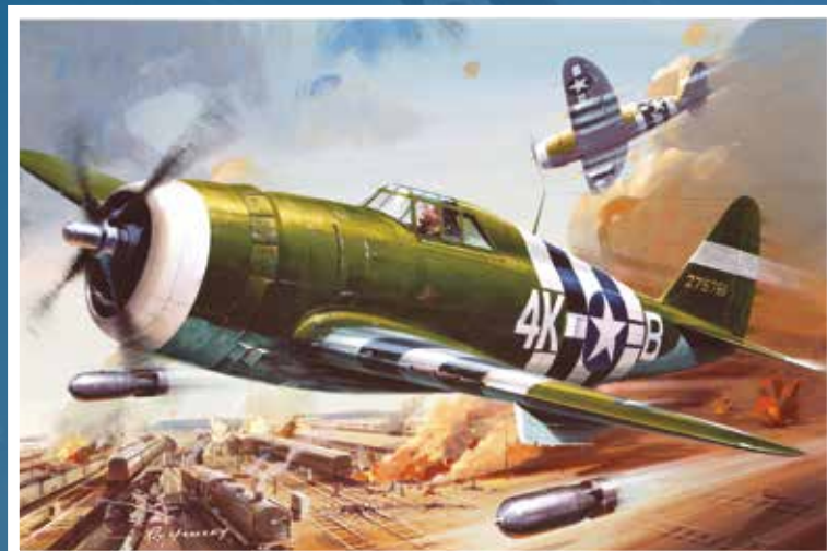
PK-022 REPUBLIC P-47D THUNDERBOLT