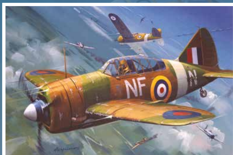
PK-024 BREWSTER BUFFALO