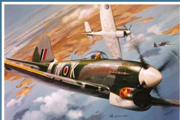
PK-023 HAWKER TEMPEST