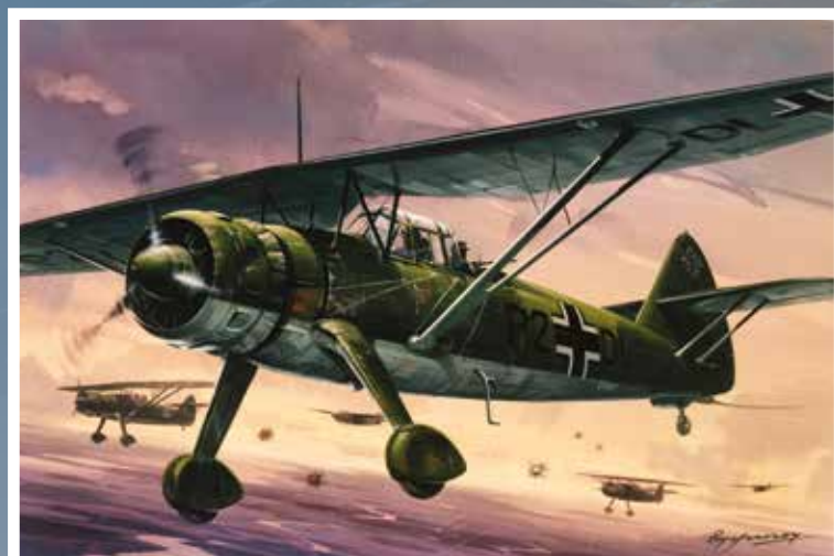
PK-026 HENSCHEL Hs126