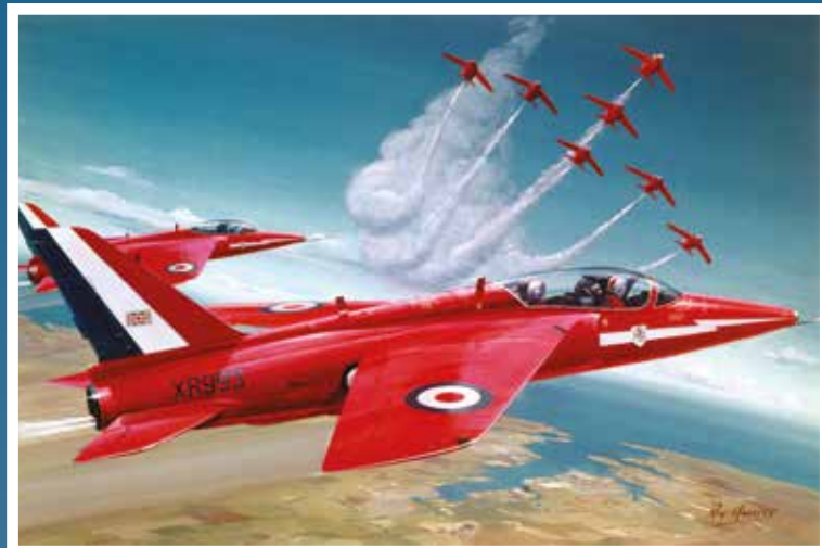
PK-015 HAWKER SIDDELEY GNAT