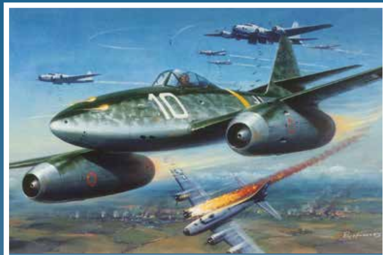
PK-021 MESSERSCHMITT Me262