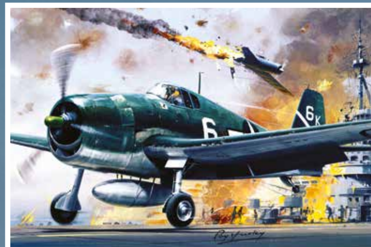
PK-018 GRUMMAN F6F-3/MK1 HELLCAT