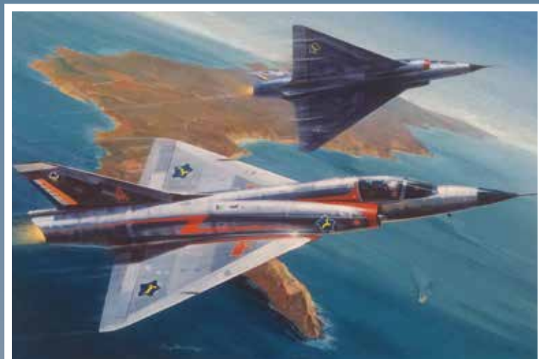
PK-020 DASSAULT MIRAGE III C