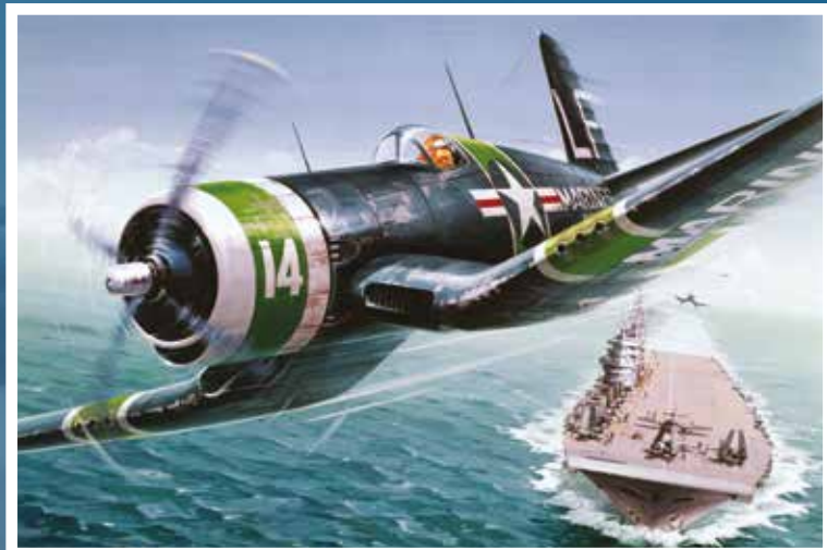
PK-014 VOUGHT F4U-4 CORSAIR