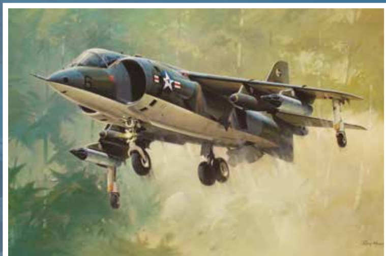
PK-016 HARRIER AV8/A